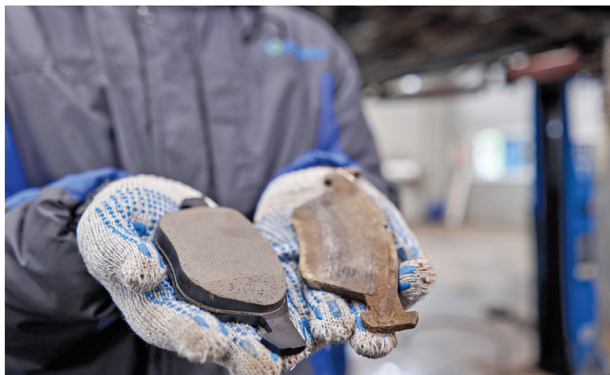
EXTRA PADDING – A mechanic shows the difference between a new brake pad and one that has been worn thin.

likely is a leak. Brake fluid is a light amber color. It's pungent odor is hard to ignore and a telling sign to have your brakes inspected.